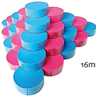
16mm short cuts

Our cutting edge cutting center enables us to deliver short cuts as short as 16mm with a horizontal print making difficult product identification a thing of the past. The slight cutting tolerance of +/- 0.15 mm allows you to exercise the precision you need for your tufting process.