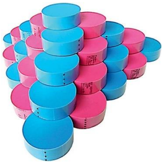
16mm short cuts

Our cutting edge cutting center enables us to deliver short cuts as short as 16mm with a horizontal print making difficult product identification a thing of the past. The slight cutting tolerance of \pm 0.15 mm allows you to exercise the precision you need for your tufting process.